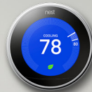
NEST LEARNING thermostat (NLT)