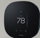
ecobee3 LITE thermostat