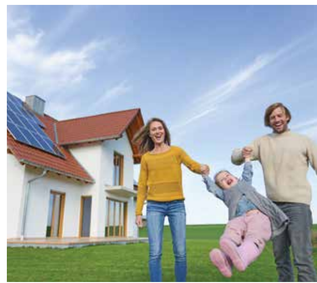
Interested in solar energy? Attend the seminar on Aug. 26 to learn more.