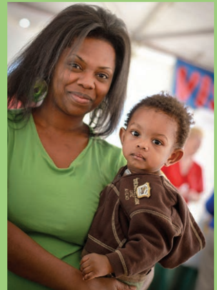
GreyStone members will receive a return on their investment in the co-op from the years 1995 and 2013.

last known address, so it is important to leave a forwarding address with the co-op if you move. If a check is not claimed after five years, the money is used through the GreyStone Power Foundation, Inc. to assist charitable nonprofits.