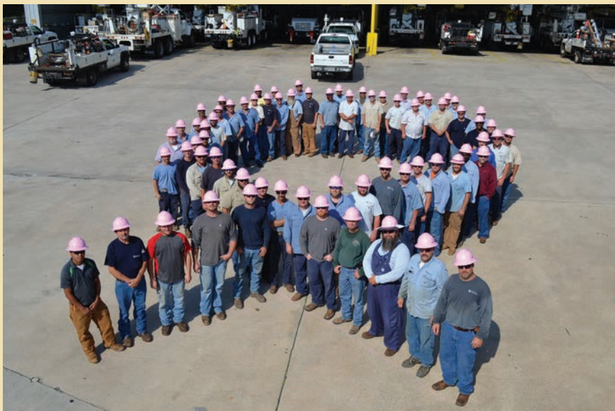
GreyStone employees form a pink ribbon to promote Breast Cancer Awareness Month. Instead of their traditional yellow or white hard hats, employees wore pink hard hats for the month of October to support the cause.

At the end of October, linemen retired their pink hard hats until next year, since the co-op intends to make it an October tradition.