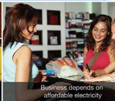
Business depends on affordable electricity