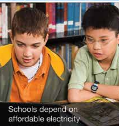
Schools depend on affordable electricity