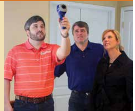
Infrared thermometers identify drafts and thermal leaks within the home.

about our rebate programs or to see if you meet the rebate requirements, visit the Save Money/Energy tab at greystonepower.com . You can also call 770-370-2070 for more info about the rebates.