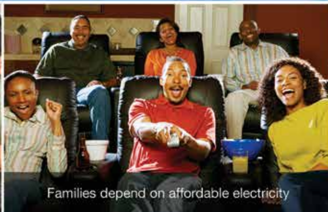
Families depend on affordable electricity