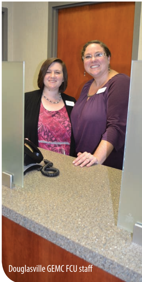
Douglasville GEMC FCU staff

If you haven't joined the credit union yet, come by and tell them happy birthday! Join the credit union and watch your savings grow!