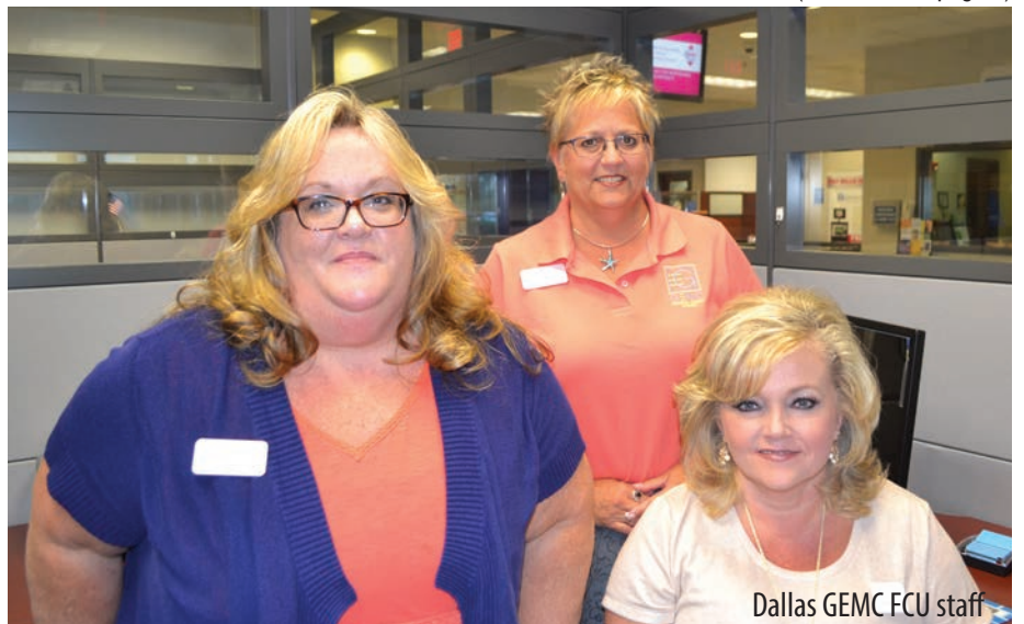
Dallas GEMC FCU staff