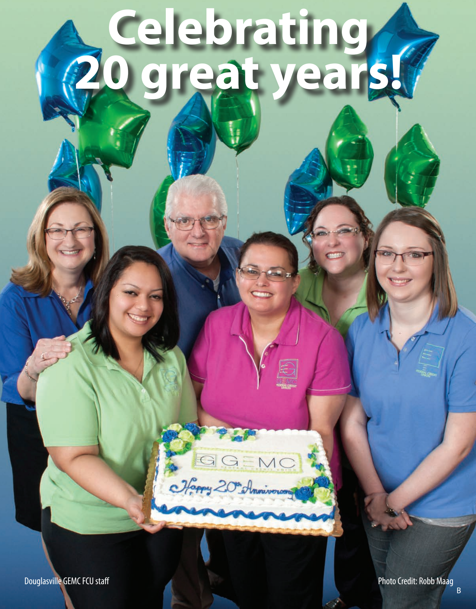
Douglasville GEMC FCU staff